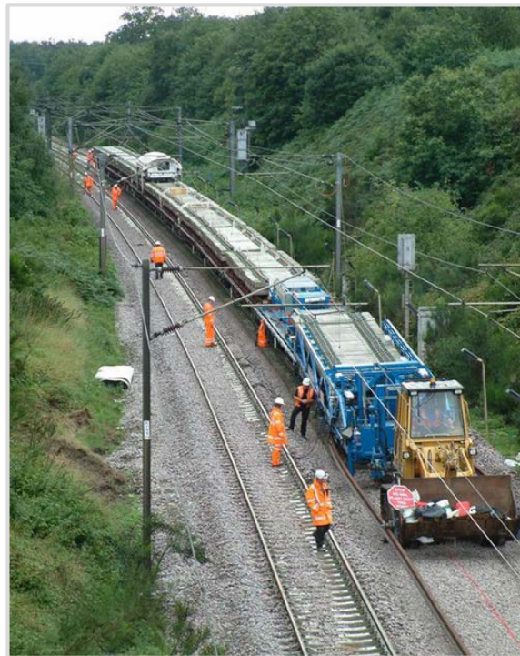
Figure 8-4: Typical New Track Construction Machine