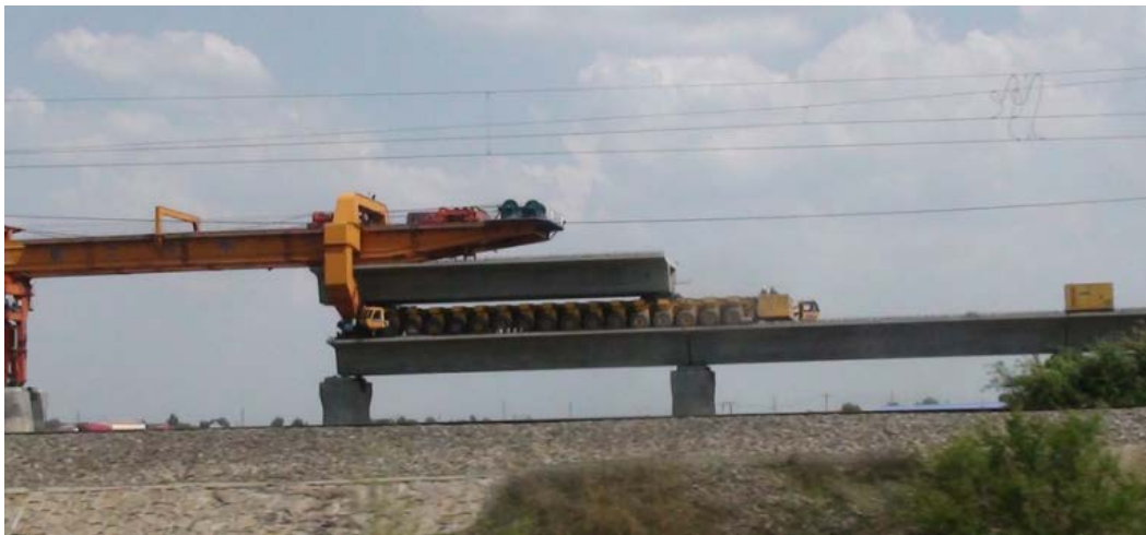
Figure 8-3: Gantry Crane System for Aerial Structure or Major Bridge Construction